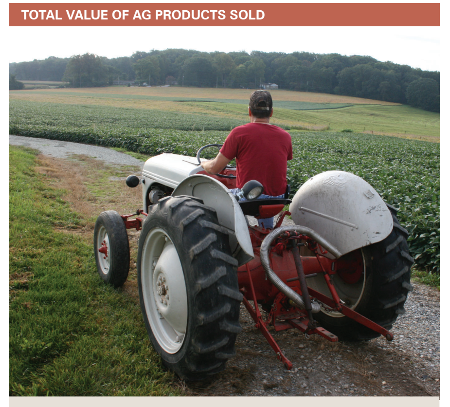
Chester County ranked 2nd among all 67 Pennsylvania counties and 53rd in the U.S. in the total value of agricultural products sold with annual sales of $712,468,000.