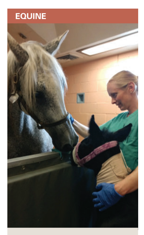
Chester County ranked 2nd in PA and 24th in the U.S. in the value of horses, ponies, mules, burros, and donkeys with sales of $5,881,000. There was an 11 percent increase in value from 2012 ($5,249,000).