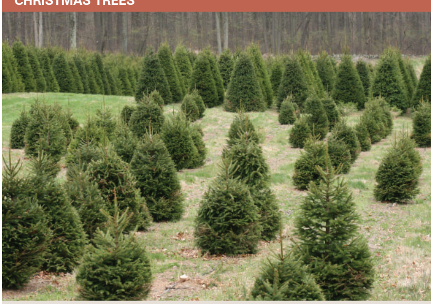
Chester County ranked 14th in PA and 69th in the U.S. in cultivated Christmas tree production with a production value of $605,000. There was an 11.7 percent increase in value from 2012 ($534,000).There are 27 farms involved in cultivated Christmas tree production. The number of farms shrank 13 percent (4 farms) from 2012.