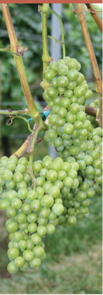
Chester County ranked 12th in PA and 338th in the U.S. in fruits, tree nuts and berries with a production value of $1,845,000. There was a 2 percent decrease in value from 2012 ($1,883,000). However, there are 110 farms growing fruits, tree nuts and berries. The number of farms grew 15 percent (16 farms) from 2012.