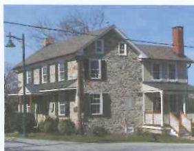
June 26, 2008 LIONVILLE HISTORIC DISTRICT: SOUTH VILLAGE AVENUE