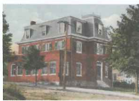
July 24, 2008 MALVERN: WOMEN OF MALVERN

This year's tour of the borough will focus on Kennett Square's unique characters that played important roles in the borough's history. As we stroll along cool, tree-lined streets, we will pause to admire architecture and gardens and revel in the stories of the people who once called a particular house "home". A poet and diplomat, a Hall of Fame Baseball player, a fugitive slave, a sculptor, and an inventor are but a few of the folks that have made this town such a unique and memorable place.