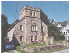
July 17, 2008 MODENA: MODENA'S MODE FAMILY