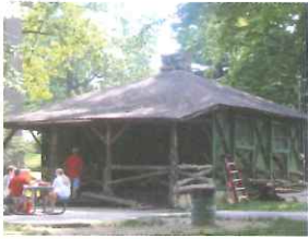
June 12, 2008 WEST CHESTER: A RAMBLE 'ROUND MR. EVERHART'S GROVE