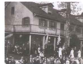
August 7, 2008 HISTORIC YELLOW SPRINGS: CHESTER SPRINGS SOLDIER'S ORPHAN SCHOOL DAYS

Come see the historic borough of Modena located on the scenic West Branch of the Brandywine Creek. Named for the Mode family who settled here in the early 18th Century, Modena was once part of East Fallowfield Township. Our tour will focus on the history and personal stories of the Mode family, the area's tradition of milling and paper manufacturing and examples of the borough's Georgian to early 20th century style architecture. Come and learn about this hidden treasure!