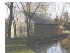
August 14, 2008 THE MILL AT ANSELMA, A NATIONAL HISTORIC LANDMARK

Come share the distaff side of Malvern Borough's history. Malvern women have cared for their husbands and children, jobs, churches, clubs, school, public library, Fire Company, businesses, and society from the 1830's to the present. Walk through the borough neighborhoods to see the varied architectural styles used for residences, such as the predominant Victorian, Edwardian, and Queen Anne. You can also find Gothic Revival, Sears bungalows, and postwar design. Also sprinkled throughout the Borough are period schools, churches, businesses, administrative buildings, a library, and the first firehouse.