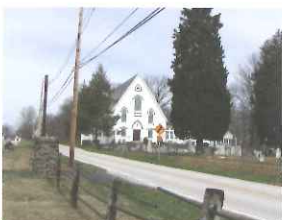
July 10, 2008 EAST PIKELAND: HILL CHURCHES & CEMETERIES ON CLOVER MILL ROAD

Tour three of West Whiteland's most prominent historical structures located on Lincoln Highway at the intersection of Pottstown Pike, the crossroads of Chester County. The resources, include the well-known Zook House (c.1754), the Guernsey Cow Dairy Barn (now the Downingtown National Bank) (c.1930) and Sleepy Hollow Hall (aka the Massey House (1717). Each property illustrates how effective adaptive reuse can both preserve and perpetuate historic structures in the face of significant development. Following the tour, guests will be treated to locally crafted ice cream in honor of the Guernsey Cow's legacy as well as light refreshments.