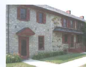
August 21, 2008 LINCOLN HIGHWAY & POTTSTOWN PIKE: CROSSROADS OF CHESTER COUNTY

Join our tour of this nearly untouched village, named for botanist Humphrey Marshall (born 1722). Marshallton Village was an important stop on the Strasburg Road, a freight road from Lancaster to Philadelphia. Being a free road it was heavily traveled since Lancaster Pike was a toll road. There were 2 hotels in the village and 1 outside dating to 1765. Among the outstanding features of the village is a Quaker Meeting dating to 1722 (present building is 1765), a cradle factory, which made grain cradles and scythes, a blacksmith shop, pump maker, cigar factory, tinsmith shop, clothing store, bakery, and 1829 Methodist Church.