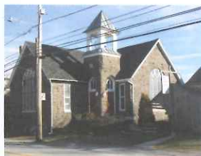
July 31, 2008 HISTORIC MARSHALLTON VILLAGE

Adaptive re-use is the main feature of the early residential and business areas of South Village Avenue. St. Paul's Lutheran Church with its 1813 barn will be utilized for refreshments and displays. The walking tour will feature legends and stories of old-time residents of the area. Find out where the circus used to come to town!