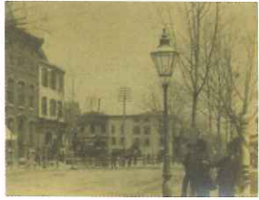
June 11, 2009 KICK-OFF CELEBRATION & TOUR BOROUGH OF WEST CHESTER: GOING TO TOWN 1

Sponsors: Chester County Historical Society and West Chester Historical and Architectural Review Board Tour Registration and information: 610-692-4800 Meet at: Chester County Historical Society