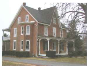
July 30, 2009 BOROUGH OF OXFORD: WE WERE OXFORD, PEOPLE FROM THE COMMUNITY'S PAST 7

A log schoolhouse stood beside the 1738 cart way, Indiantown Road, where wagons loaded with iron products from the furnaces passed through on their way to the Wilmington market. Later the 1859 schoolhouse with its second story community room became the setting for this historic Indiantown crossroads and the early Springton Manor story. As the Norwood hamlet grew into the Glenmoore Village, ornately decorated houses were constructed for newly married couples, hence Bridal Row. We look forward to sharing our architectural past with you.