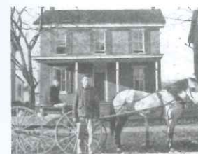
August 20, 2009 BOROUGH OF AVONDALE: FROM WHEAT FIELDS TO BOROUGH 10

The Village of Berwyn grew along the historic tracks of the Main Line and the first turnpike in the new United States that ran from Philadelphia to Lancaster. The village spreads into both Easttown and Tredyffrin Townships. The walking tour weaves through the town from the churches above down to the railroad station squeezed between the tracks and Lancaster Pike. Visitors also will see the Berwyn Veterans Memorial that honors area veterans from all the Nation's wars. Refreshments at Handel's Ice Cream!