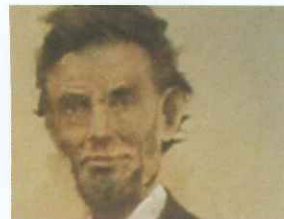
June 25, 2009 BOROUGH OF KENNETT SQUARE: LINKS TO LINCOLN 3

Help Chester County's oldest town celebrate its 150th anniversary, May 16, 2009. Featured will be Chester County's oldest dwelling: the 1701 Log House. Architectural tours will focus on all periods including the fine homes reflecting the prosperity with the arrival of the railroad in the mid 19th century. At the outbreak of the Civil War in 1861, Downingtown had 800 citizens; about 100 men left to fight in the war. This summer we are celebrating their contribution along with the stories of our past residents.