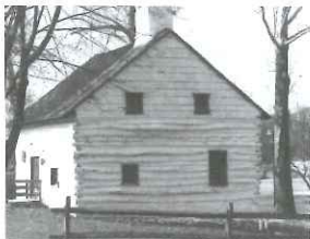
June 18, 2009 BOROUGH OF DOWNINGTOWN: 150 YEAR ANNIVERSARY CELEBRATION 2

Sponsor: Downingtown Historical and Parks Commission Reservations: 610-269-0322 Ex. 246 Meet at: The Log House