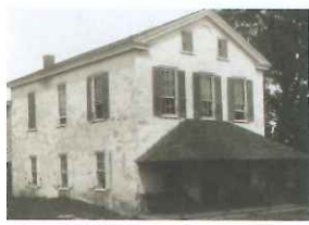
July 23, 2009 VILLAGE OF GLENMOORE: TRACING A VILLAGE'S GROWTH 6

With Quaker roots that run as deep as those of the oaks that line its Grove, the Village of Ercildoun was a major stop on the Underground Rail Road. It is also the final resting place of Rebecca Lukens (first woman industrialist) and many others who fought to abolish slavery. Ercildoun's appearance has changed very little over the years. Come and discover its many hidden charms and stories of the County's past in liberating slaves.