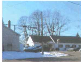
July 16, 2009 VILLAGE OF ERCILDOUN: ON THE ROAD TO FREEDOM 5