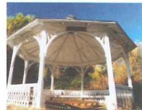
August 6, 2009 HISTORIC YELLOW SPRINGS: CELEBRATING 35 YEARS! 8

By the early 1700's the Scotch-Irish had settled in Oxford along an old Nanticoke Indian trail that led to the Chesapeake Bay. By 1754, there was a community formed around Hood's Tavern and the Presbyterian Church. But the great growth came with the arrival of the railroad in 1860. Experience the early Victorian architecture of Oxford and meet the men and women who were responsible for the founding of Lincoln University, starting the 2nd oldest library in the state (1784) and having their own newspaper, bank, water company, fire company and electric company by the end of the 19th century. Surprise visitors will include Annie Oakley!